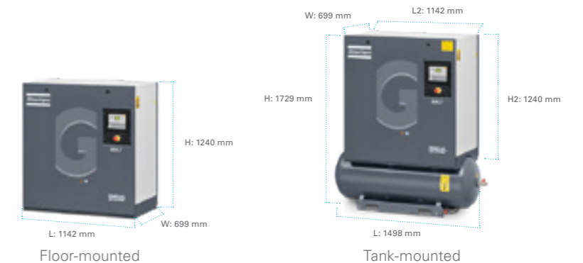
GA 5-7-11 pack (tank-mounted)